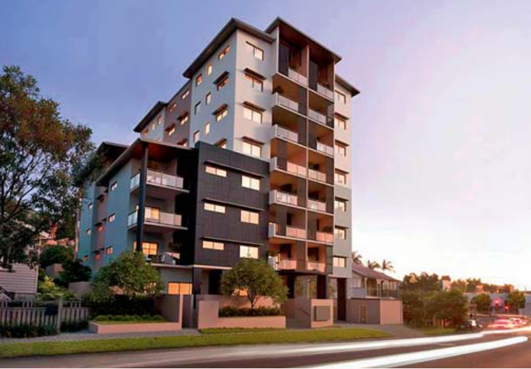
Hutchies has been appointed to build Tessa Developments' next project, the $20 million Parkside on Folkestone at Bowen Hills.