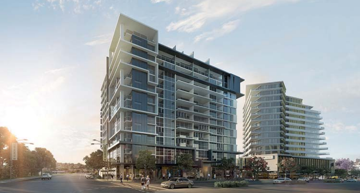
Artist's impression of The Hudson under construction in the inner-Brisbane suburb of Albion.