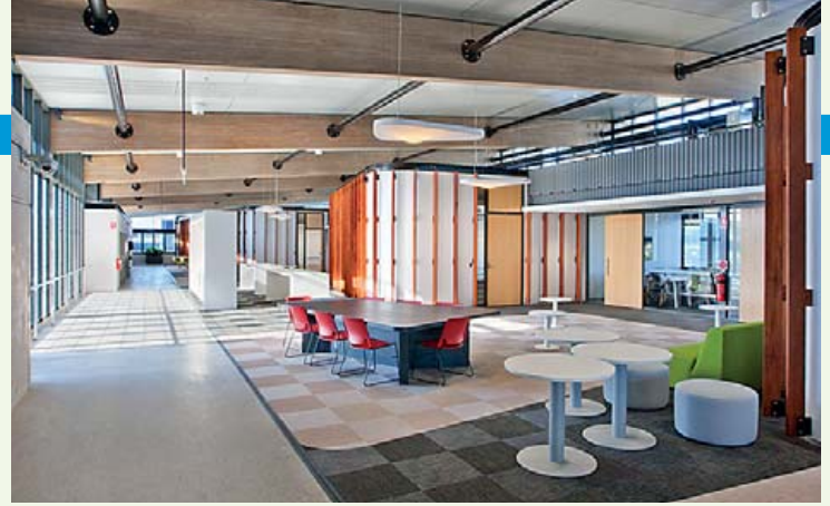
New facilities include cutting-edge learning and teaching spaces for tomorrow's engineers.