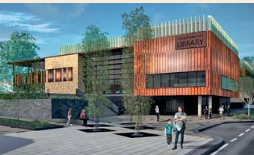
The Toowoomba City Library will be a stunning addition to the Garden City.

They include Dolley Concreting, Triplex, Southern Cross Bricklaying, A. G. Rigging and Steel and TNT Roofing.