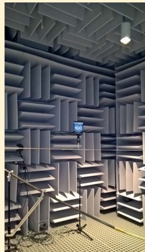
Inside the anechoic chamber.

The combination of these aspects means the chamber simulates a quiet open-space of infinite dimension which is essential where exterior influences would give false test results.