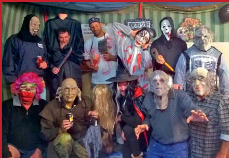
Hutchies' horrible team ... some of these guys have never looked so good!