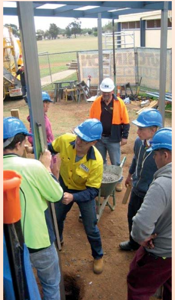
Students from Oakey State High School building shade shelters in the school grounds.

A NEW program from Hutchies' Gold Coast School of Construction (GCSC) this year is Ready 4 Construction (R4C).