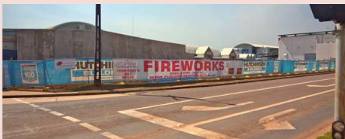
Hutchies' building sites supported Territory Day celebrations.

With delicious food from the markets, people picnic on the sand as they watch the fireworks over the Timor Sea.