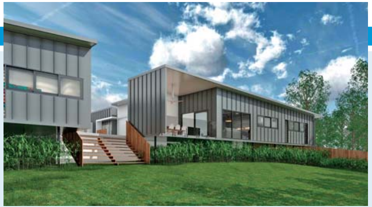
Hutchies is building 14 single-storey units in Capalaba.