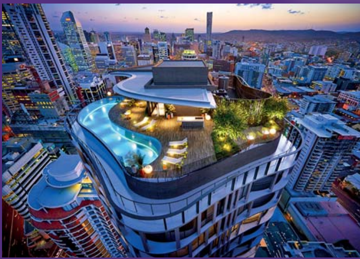
Artist's impression of how 40-level Spire will dominate Brisbane's CBD. – Jobs Update, Pages 14 & 15.