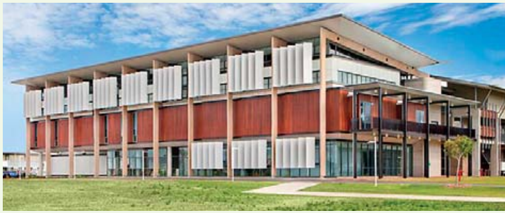
The USC's new Futures Engineering Building at Sippy Downs built with use of timber with concrete.