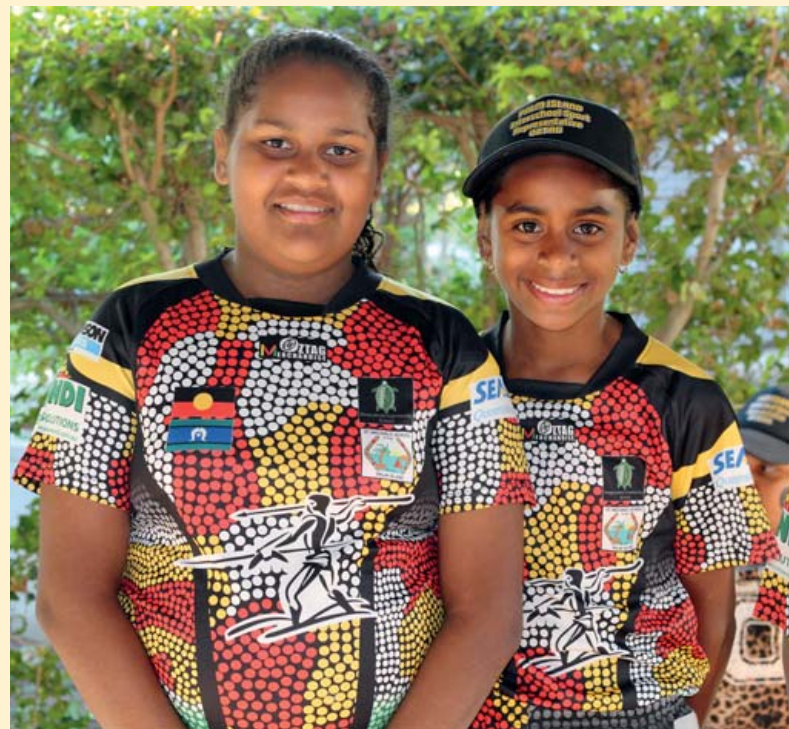
New sports uniform for Aboriginal students on Palm Island.

A STUNNING new sports uniform funded by Hutchies' Townsville team and Mendi Construction is helping Aboriginal students on Palm Island join in an inter-school sports program on the mainland.