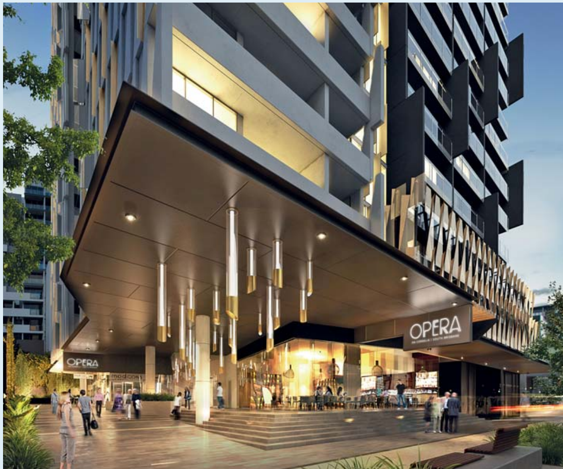
Opera in South Brisbane will include ground floor retail outlets below 180 apartments.