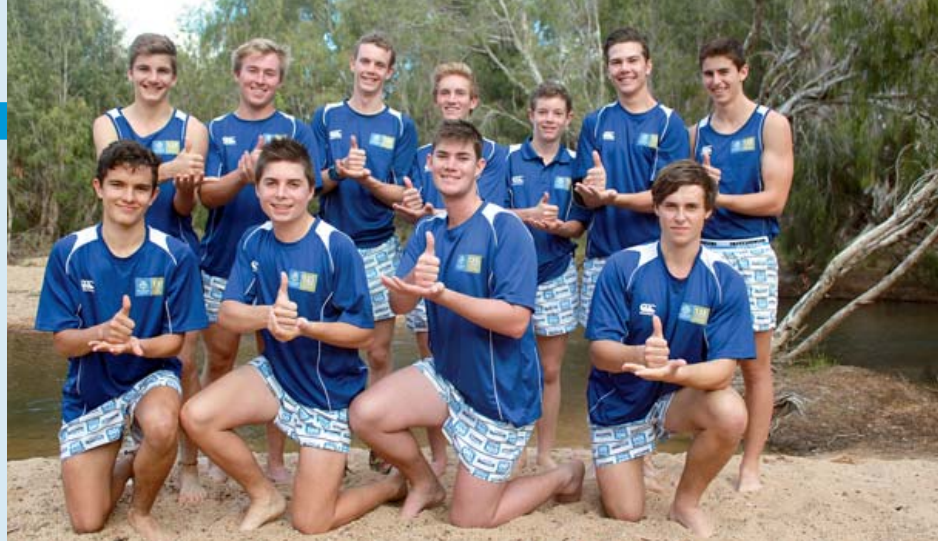
The victorious Nudgee College Great Wheelbarrow Race team.

Trinity recently won the Trophy Regatta at Lake Wyaralong.